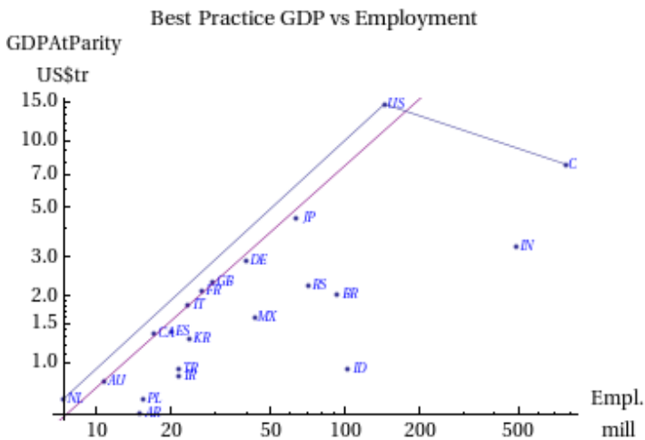
Fig. 2 GDP at Parity versus Employed Persons with best practice envelope and constant scale trajectory

Figure 2 shows how Australia compares to other countries in terms of GDP at purchasing power parity and Employment. Australia (AU) is nearest but one (NL) to the plot origin. An envelope of best practice is drawn from The Netherlands (NL) to the USA (US) and from the USA (US) to China (C).